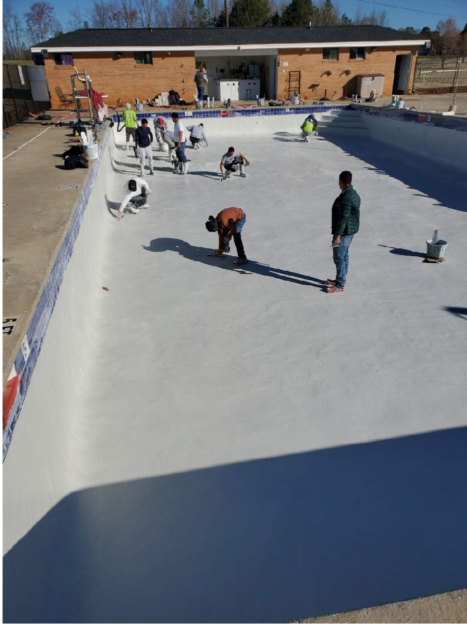
Twenty men finished the plastering in FIVE hours. Water was immediately started in the deep end as the plaster was already hydrating.