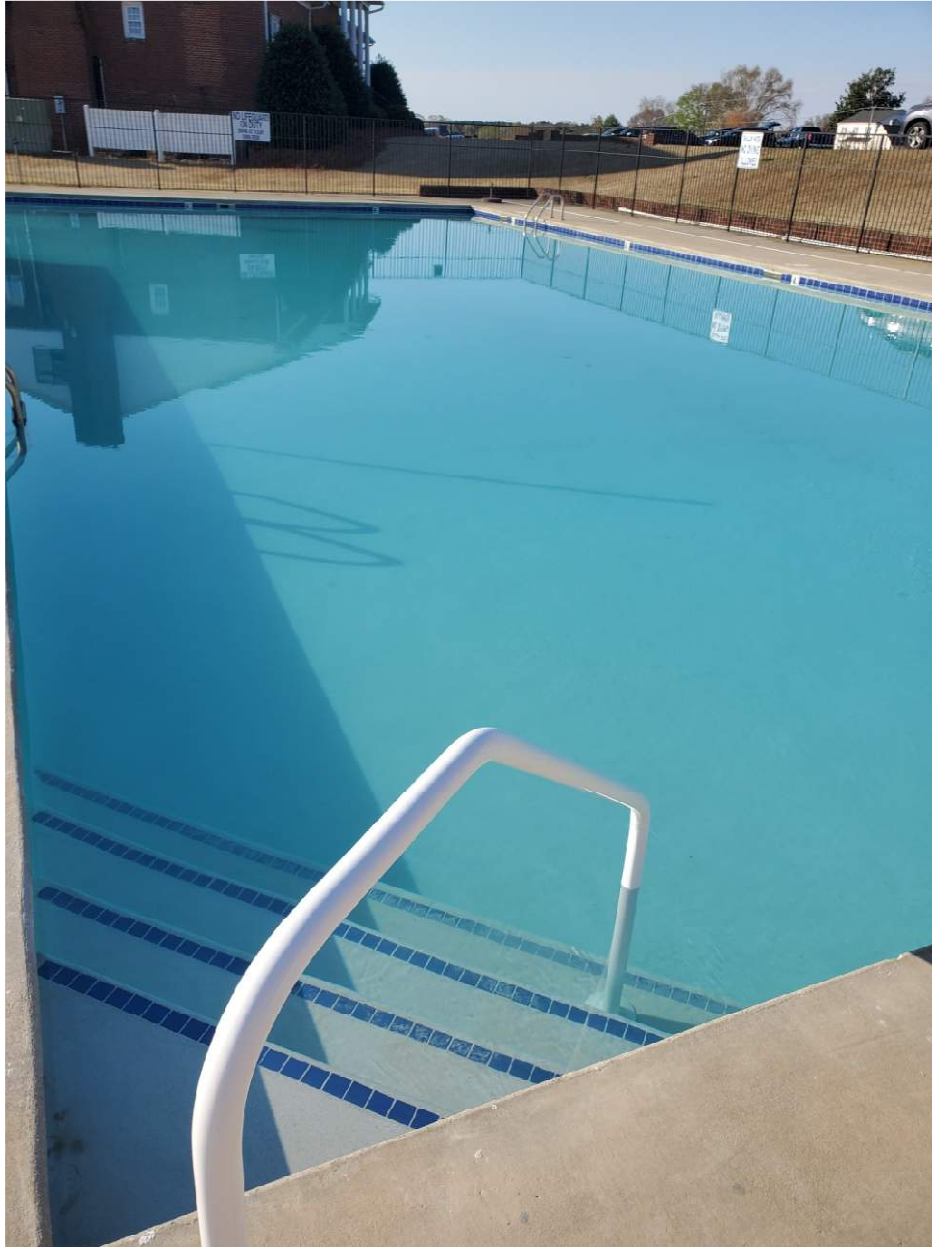
Correct handrail installed to conform to DHEC spec.

As of March 31, 2025, the pool water is balanced along with the new handrail.